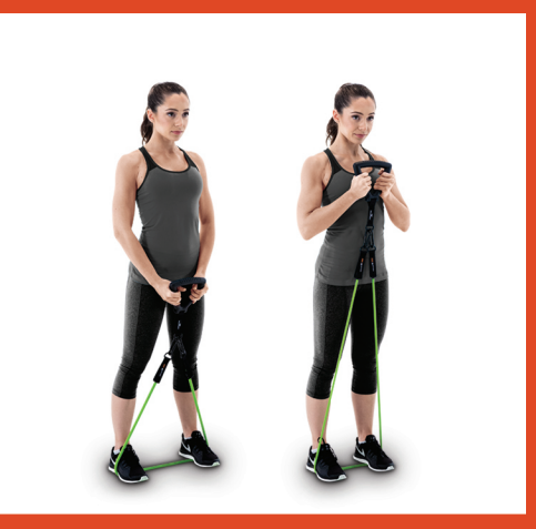
HAMMER CURL GEAR RESISTANCE TUBE & TRI-GRIP HANDLE