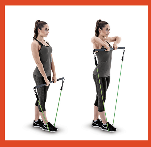
UPRIGHT ROW GEAR RESISTANCE TUBE & BIONIC BAR