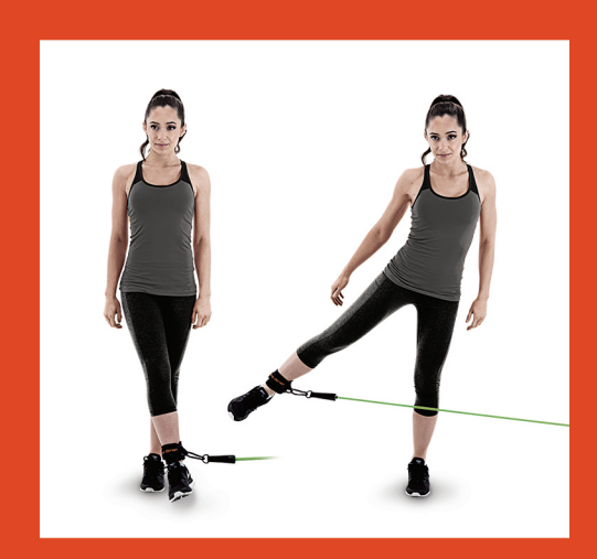
HIP ABDUCTION GEAR RESISTANCE TUBE, ANKLE/ARM STRAP, & DOOR ANCHOR