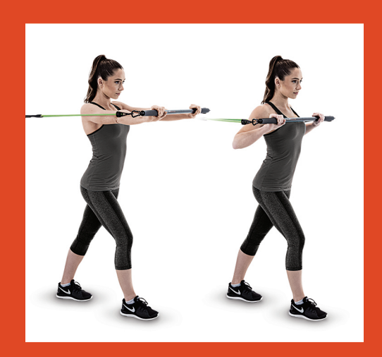
CHEST PRESS GEAR RESISTANCE TUBE, BIONIC BAR, & DOOR ANCHOR