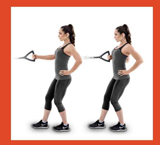
ONE ARM ROW GEAR RESISTANCE TUBE. TRI-GRIP HANDLE, & DOOR ANCHOR