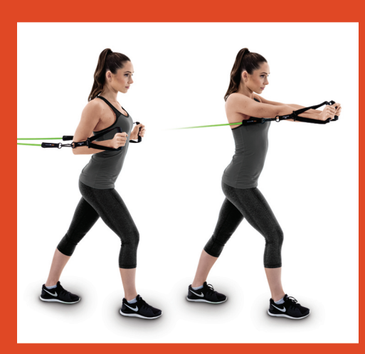
CHEST PRESS GEAR RESISTANCE TUBE. SINGLE-HANDLES, & DOOR ANCHOR