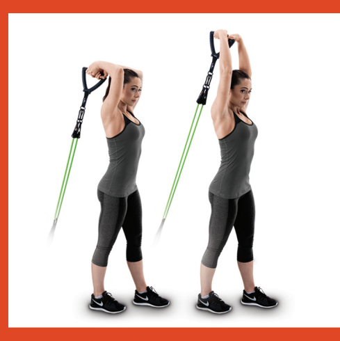
TRICEP EXTENSION GEAR RESISTANCE TUBE, TRI-GRIP HANDLE, & DOOR ANCHOR