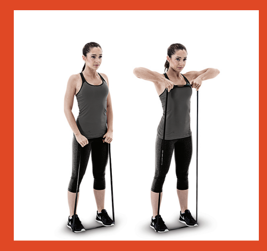
UPRIGHT ROW GEAR RESISTANCE BAND