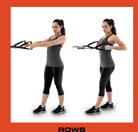
GEAR RESISTANCE TUBE, SINGLE-HANDLES, & DOOR ANCHOR