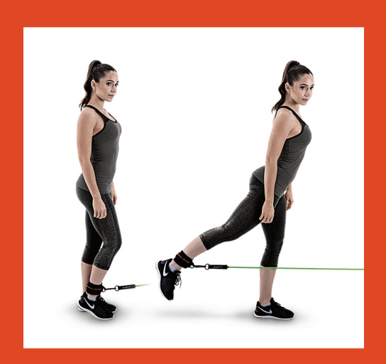
HIP EXTENSION GEAR RESISTANCE TUBE, ANKLE/ARM STRAP, & DOOR ANCHOR