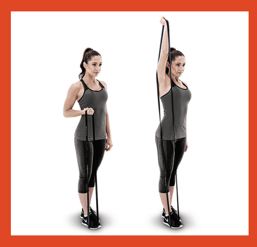
SHOULDER PRESS GEAR RESISTANCE BAND